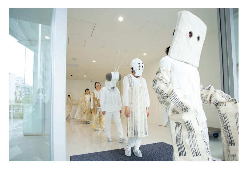
A procession of performers in paper masks and costumes leaving the museum for the streets; as part of Light, Movement and Shadow of My Papersmile, a performance and installation by Tone Fink (with Chantal Dorn) at the Oita Prefectural Art Museum, Japan, 2016.

Showing and seducing, moving and "being" are important for me, that I am alone again when drawing and labeling, painting, and handicrafts. That's why my films are important to me, because I love to present theater to the audience with my creations and make them want to participate. In order to actually constitute oneself as the mobile that unites becoming and being, one must realize in oneself the impression of becoming lighter (becoming an imaginary mass). Think with the body! In order to see, one does not have to stand still.<sup>3</sup>