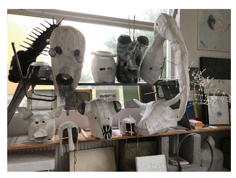
Paper-covered objects for Tone Fink's performance piece, Aufstand der Tiere (Revolt of Animals), a procession that will take place in Schwarzenberg, Austria, July 2020, as part of the town's 750th-anniversary celebration.